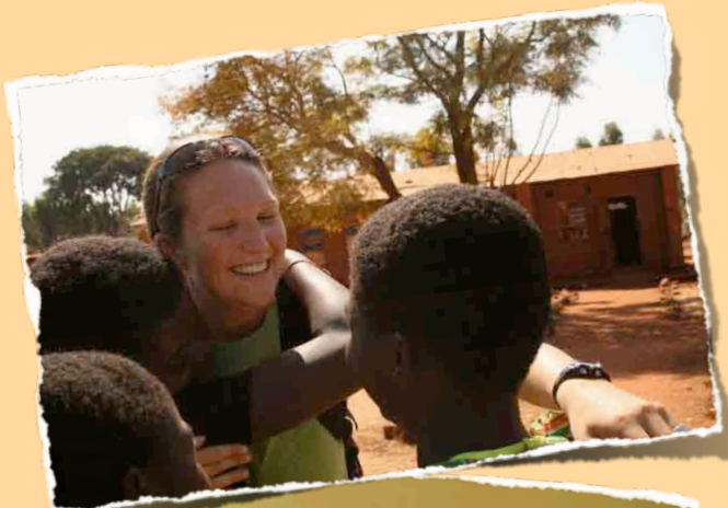
WORLD CAMP MALAWI HOSTED OVER 60 VOLUNTEERS IN 2008