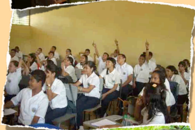
WORLD CAMP HONDURAS TAUGHT NEARLY 1300 STUDENTS IN 2008