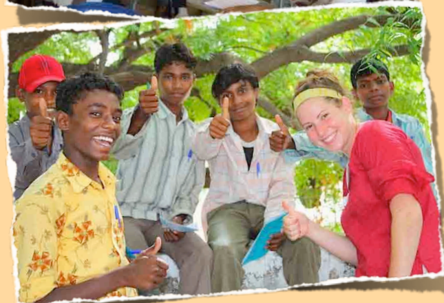
WORLD CAMP INDIA GIFTED NEARLY 1000 TREES IN 2008